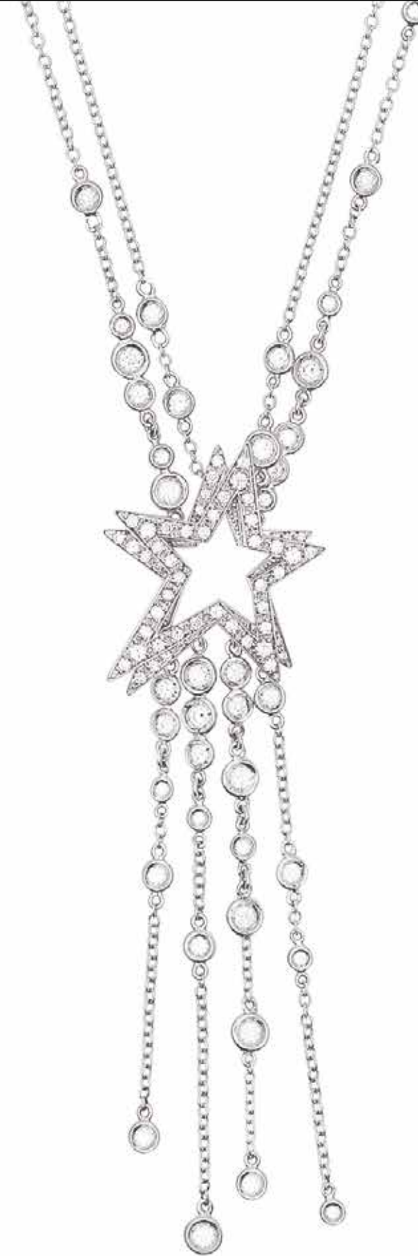
SAUTOIR IN WHITE GOLD AND DIAMONDS