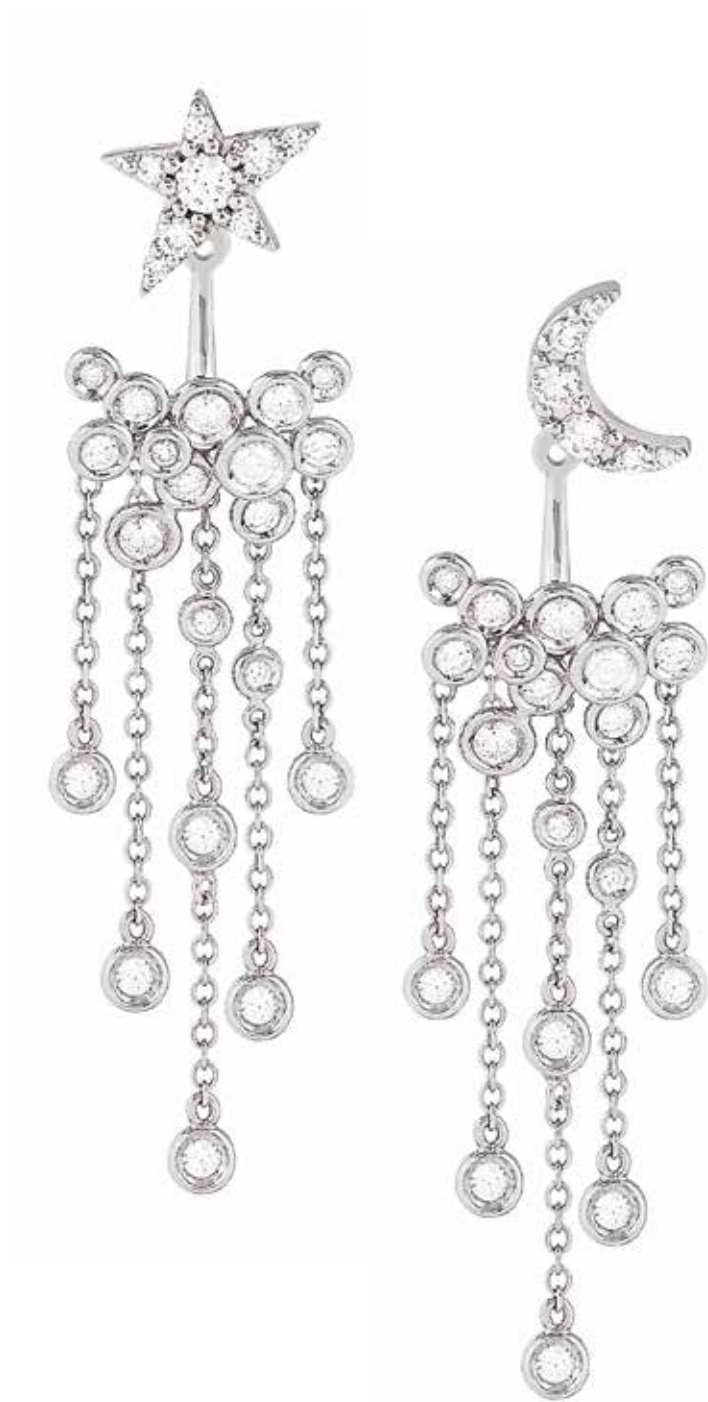
EARRINGS IN WHITE GOLD AND DIAMONDS