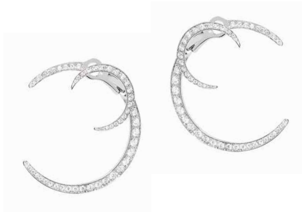
EARRINGS IN WHITE GOLD AND DIAMONDS