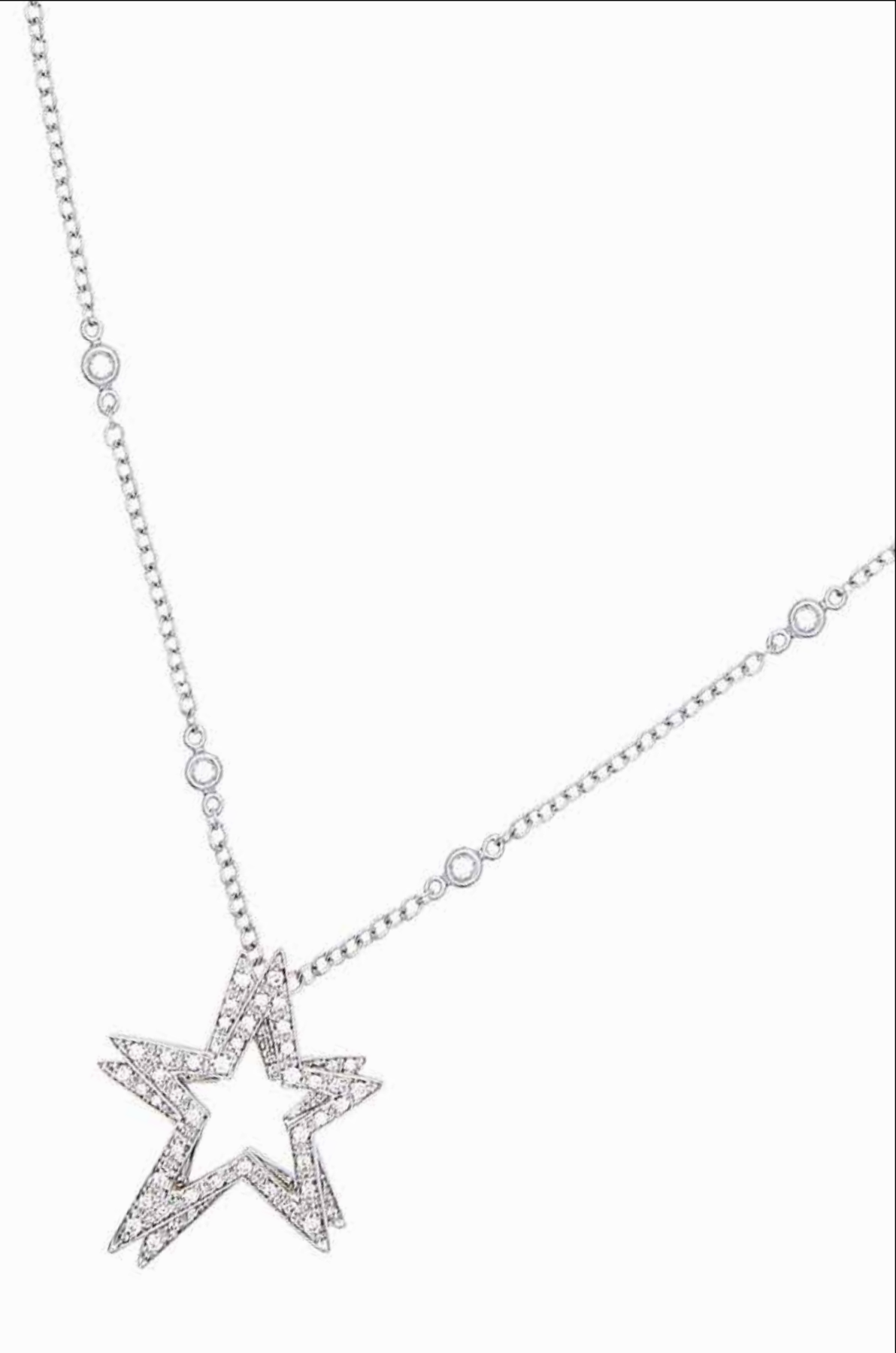
NECKLACE IN WHITE GOLD AND DIAMONDS