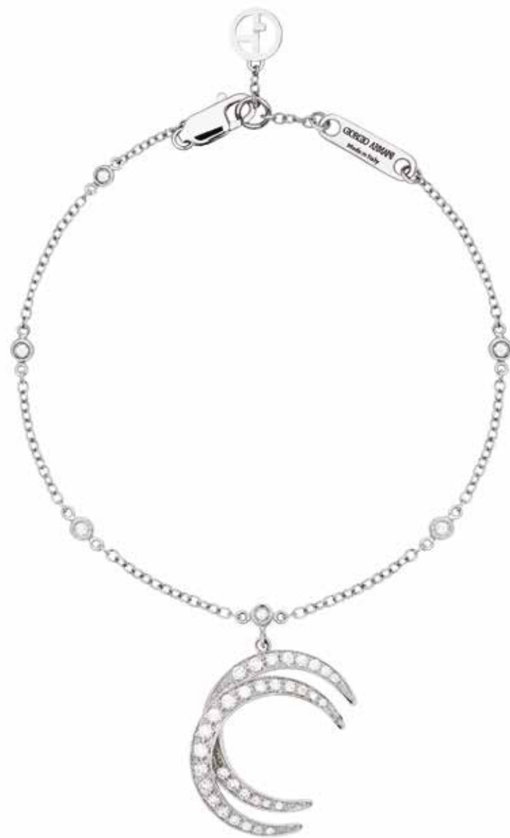
EARRINGS IN WHITE GOLD AND DIAMONDS BRACELET IN WHITE GOLD AND DIAMONDS