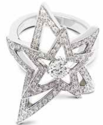
BRACELET IN WHITE GOLD AND DIAMONDS RING IN WHITE GOLD AND DIAMONDS