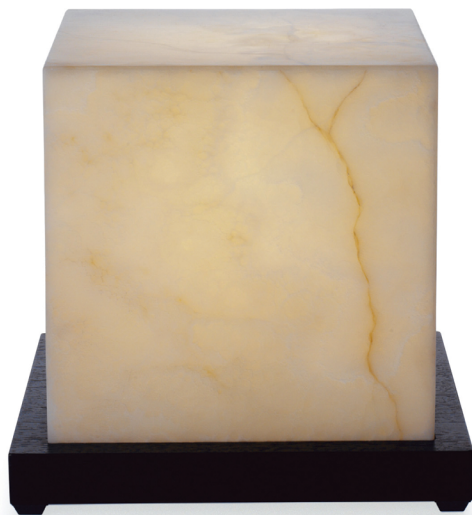
ALABASTER Table Lamp