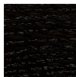
Brushed Brown Oak