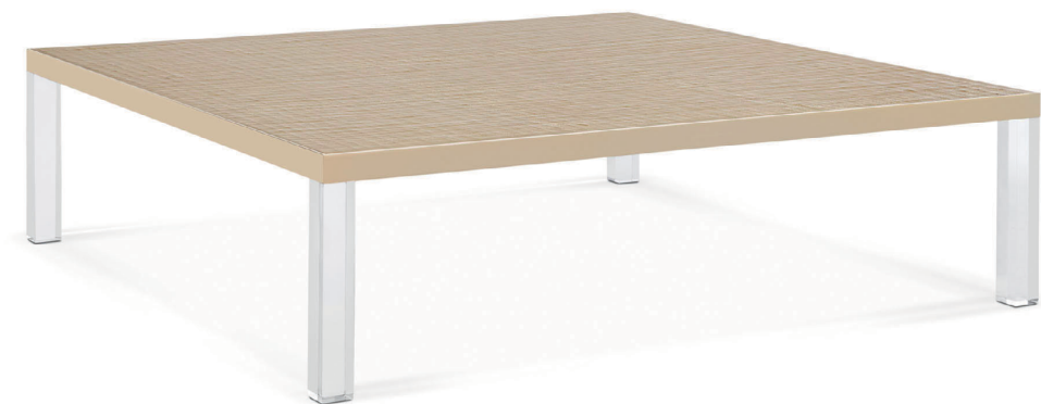
NINFEA Coffee Table