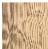
Brushed Honey Ashwood