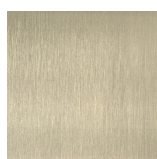
Satin Light Brass