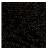
Brushed Brown Ashwood