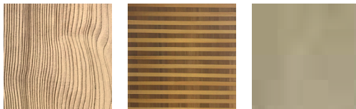
Brushed Honey Ashwood/ Crisscross Natural Straw/ Platinum Lacquer