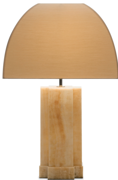
BLOOM Table Lamp